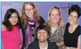
Making a Difference in Africa

Western Engineering Blog What WE have to say