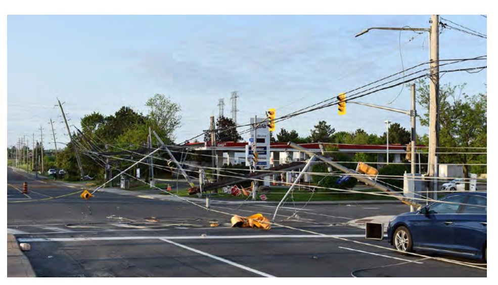
Storm damage on Merivale Road at Viewmount Drive caused by the May 2022 Derecho that struck the city of Ottawa.

The derecho in Southern Ontario/ Southern Quebec in May, post tropical storm Fiona in September and the bomb